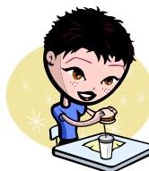
Eat at different times