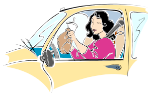
Fast Food in the car